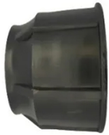
Cap Nut Polpropylene (PP)

Longer Lifespan of O-Ring Compact Design Ergonomic Design