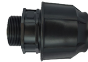
MALE THREADED ADAPTOR