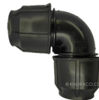
EQUAL 90° ELBOW