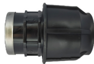
FEMALE THREADED ADAPTOR