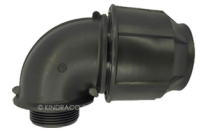
MALE BEND 90° ELBOW